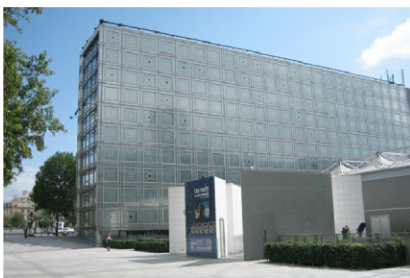
arab world institute, jean nouvel - 1987

Through a series of baffles that automatically move according to the incidence of sunlight, Nouvel has created an evocative facade, characterized by typical Arab geometries, which transmit to the visitor the magic of the Islamic iconography.