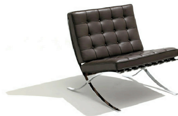
barcelona, mies van der rohe - 1929

The clean and streamlined shape is perfect.