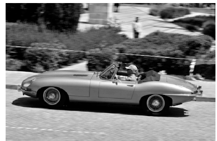
jaguar e-type - 1961