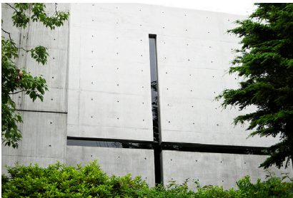
church of light, t. ando - 1989

With the introduction of a cut in the shape of a cross on the back wall of his church in Ibaraki, the architect Tadao Ando generates, through light, the sacred symbol that becomes the purpose and essence of the project.