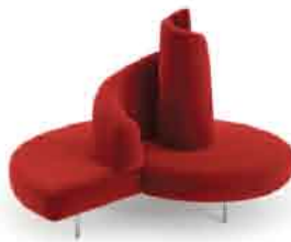
tatlin, edra - 1989