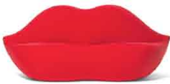
bocca, gufram - 1971

The formal elements related to the erotic imaginary combined with the use of an intense red strongly attract the user's attention.