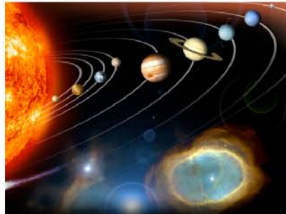
solar system - set of atoms