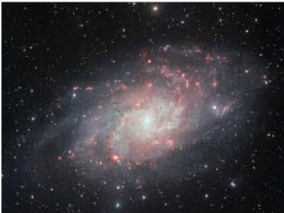
galaxy - set of solar systems

From the infinitely large to the infinitely small mechanisms and rules that lead to a project which meets the needs of men and is correct from the point of view of ethics and society are the same.